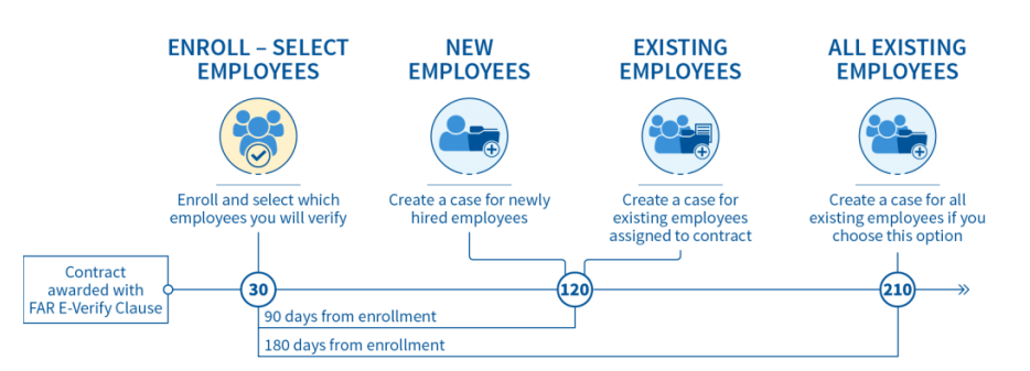
Figure 3: Deadlines for New Participants with the FAR E-Verify Clause